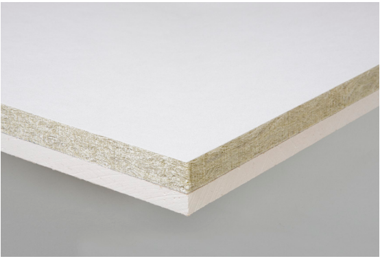
38 mm (NRC 0.75)